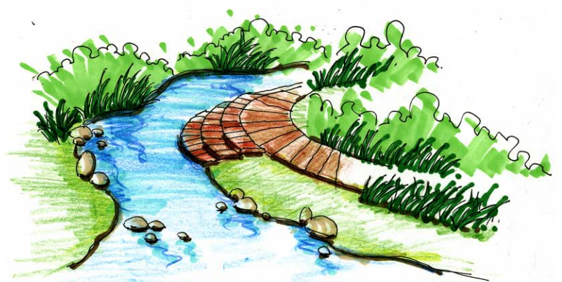
BOARDWALK AND CREEK OBSERVATION