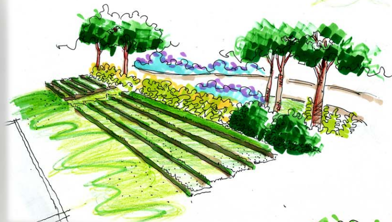
TERRACED GRASS SEATING